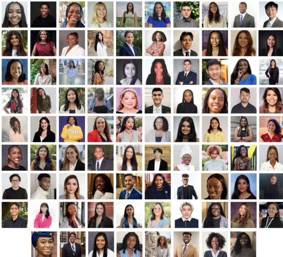
2023 TLF Scholarship Recipients